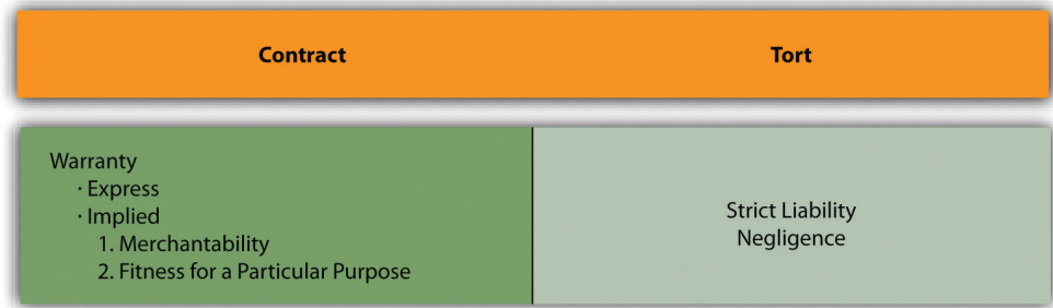
Figure 17.1 Major Products Liability Theories