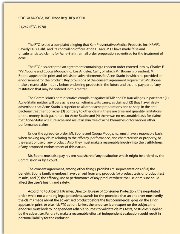
Consent Decree: Pat Boone and Cooga Mooga, Inc.

That a particular consumer is in fact ecstatic about a product does not save a false statement: it is deceptive to present this glowing testimonial to the public if there are no facts to back up the customer's claim. The assertion "I was cured by apricot pits" to market a cancer remedy would not pass FTC muster. Nor may an endorser give a testimonial involving subjects known only to experts if the endorser is not himself that kind of expert, as shown in the consent decree negotiated by the FTC with singer Pat Boone (Figure 49.2).