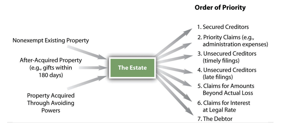
Figure 30.3 Distribution of the Estate