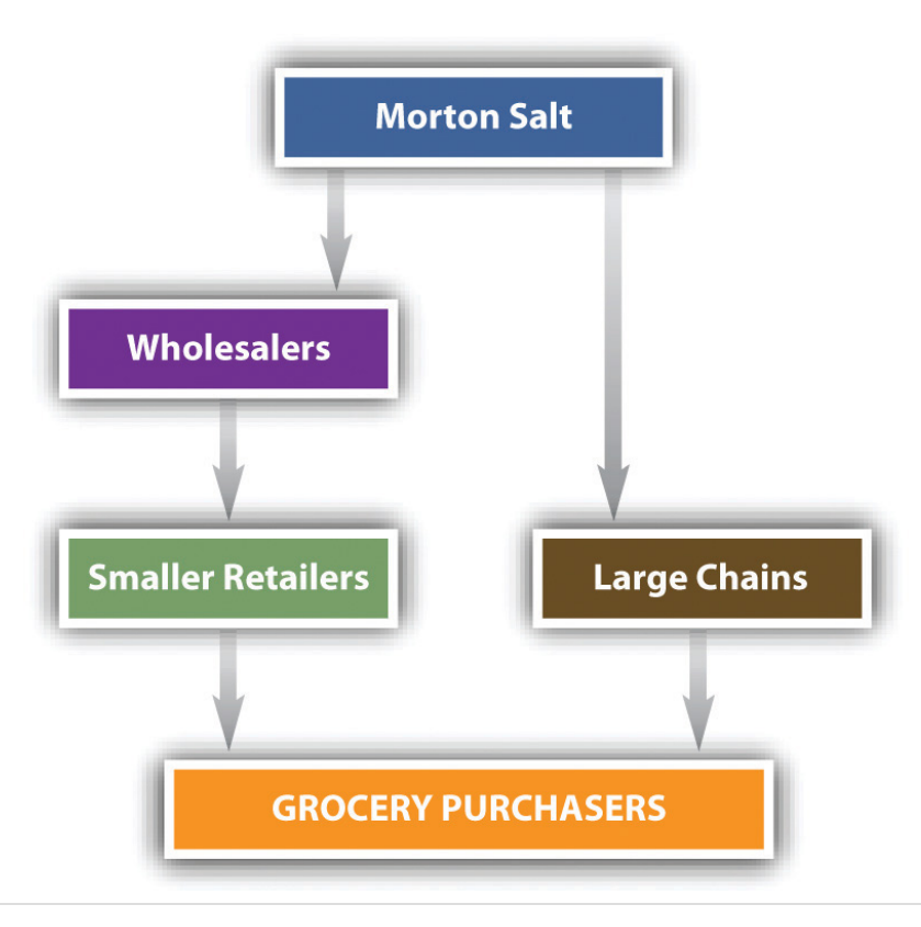
Figure 21.5 Variation: Morton Salt Co.

In order to make out a case of secondary-line injury, it is necessary to show that the buyers purchasing at different prices are in fact competitors. Suppose that Ace Brothers sells to Fast Widgets, the retailer, and also to Boron Enterprises, a manufacturer that incorporates widgets in most of its products. Boron does not compete against Fast Widgets, and therefore Ace Brothers may charge different prices to Boron and Fast without fearing Robinson-Patman repercussions. Figure 21.6 "Variation: Boron-Fast Schematic" shows the Boron-Fast schematic.