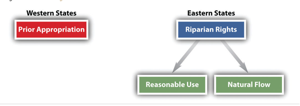
Figure 24.2 Water Rights

In contrast to riparian rights doctrines, western states have adopted the prior appropriation doctrine. This rule looks not to equality of interests but to priority in time: first in time is first in right. The first person to use the water for a beneficial purpose has a right superior to latecomers. This rule applies even if the first user takes all the water for his own needs and even if other users are riparian owners. This rule developed in water-scarce states in which development depended on incentives to use rather than hoard water. Today, the prior appropriation doctrine has come under criticism because it gives incentives to those who already have the right to the water to continue to use it profligately, rather than to those who might develop more efficient means of using it.