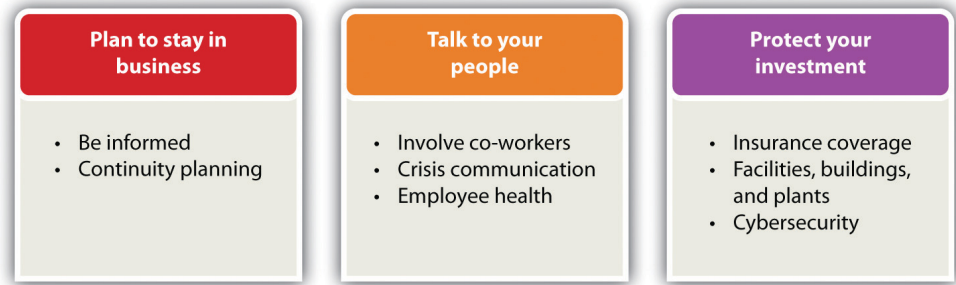
Figure 14.1 Disaster Planning