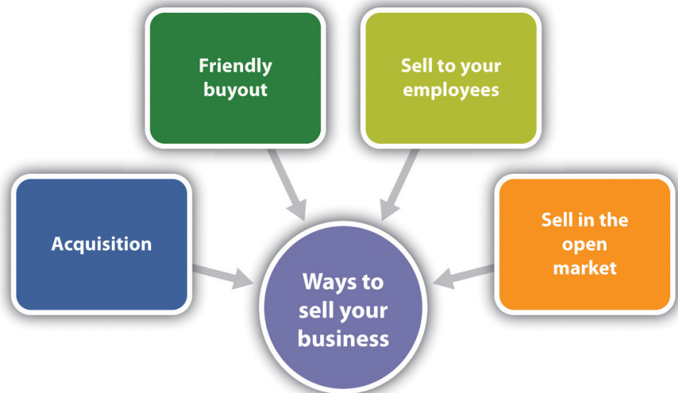
Figure 14.5 Four Ways to Sell a Small Business

There are different ways to sell a business (see Figure 14.5 "Four Ways to Sell a Small Business" ). Acquisition, friendly buyout, selling to the employees, and selling on the open market are discussed here. Be aware, however, that if a business is floundering and it is well known that the business is having major problems paying bills, vulture capitalists 14 might start circling. A vulture capitalist is a venture capitalist 15 who invests in floundering firms in the hope that they will turn around. "Vulture Capitalist," Investopedia , accessed February 6, 2012, www.investopedia.com/terms/v/vulturecapitalist.asp ; "Vulture Capitalist," Urban Dictionary , November 12, 2009, accessed February 6, 2012, www.urbandictionary.com/define.php?term=Vulture%20Capitalist . A venture capitalist is an investor who either provides capital to start-up ventures or supports small companies to expand but does not have access to public funding. Venture capitalists typically expect higher returns because they are taking additional risks. "Venture Capitalist," Investopedia , accessed February 6, 2012, www.investopedia.com/terms/v/venturecapitalist.asp .