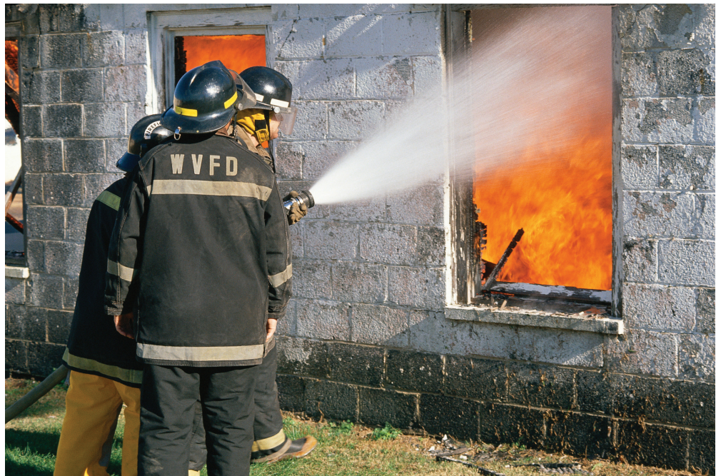
Figure 14.2 Disaster Damage