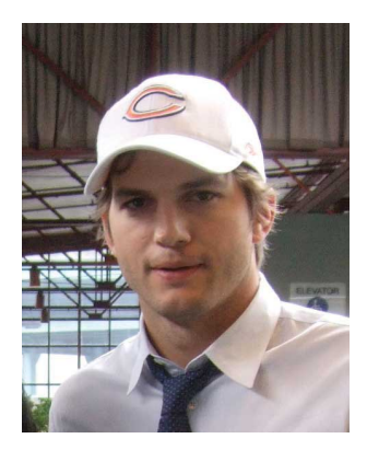
Ashton Kutcher was the first person to have over a million followers on Twitter.