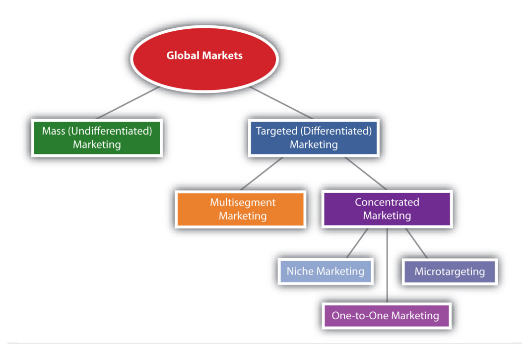
Figure 5.9 Targeting Strategies Used in Global Markets

communicating with customers around the world and devising different marketing campaigns for each of them.