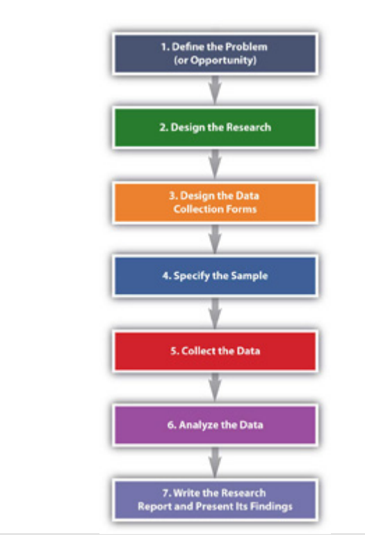
Figure 10.6 Steps in the Marketing Research Process

The basic steps used to conduct marketing research are shown in <u>Figure 10.6 "Steps</u> in the Marketing Research Process". Next, we discuss each step.