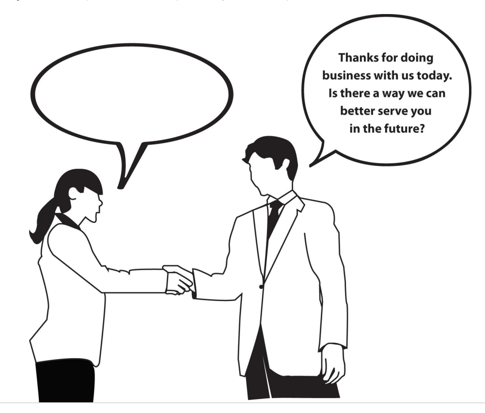
Figure 10.8 Example of a Cartoon-Completion Projective Technique

In some cases, your research might end with exploratory research. Perhaps you have discovered your organization lacks the resources needed to produce the product. In other cases, you might decide you need more in-depth, quantitative research such as descriptive research or causal research, which are discussed next. Most marketing research professionals advise using both types of research, if it's feasible. On the one hand, the qualitative-type research used in exploratory research is often considered too "lightweight." Remember earlier in the chapter when we discussed telephone answering machines and the hit TV sitcom Seinfeld ? Both product ideas were initially rejected by focus groups. On the other hand, relying solely on quantitative information often results in market research that lacks ideas.