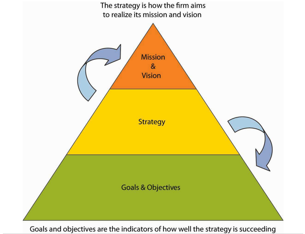
Figure 4.3 Mission and Vision in the Planning Process