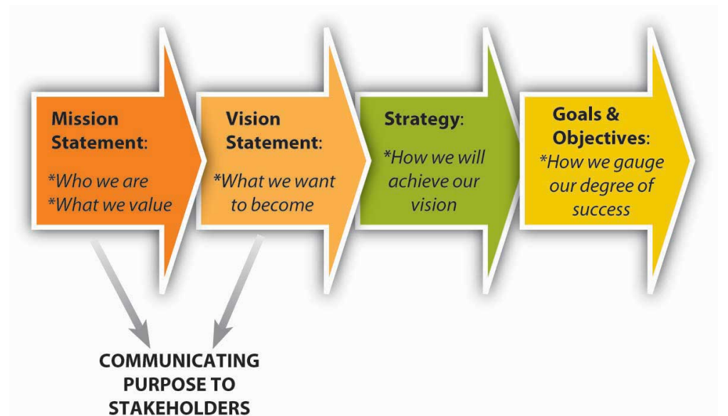
Figure 4.4 Key Roles of Mission and Vision

Mission and vision statements play three critical roles: (1) communicate the purpose of the organization to stakeholders, (2) inform strategy development, and (3) develop the measurable goals and objectives by which to gauge the success of the organization’s strategy. These interdependent, cascading roles, and the relationships among them, are summarized in the figure.