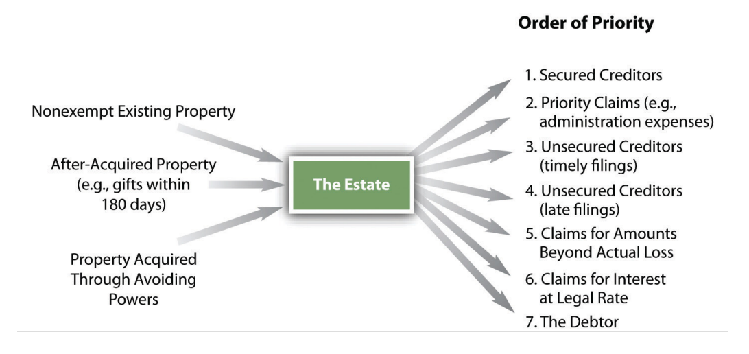
Figure 35.3 Distribution of the Estate