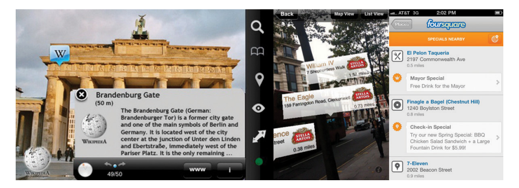
Figure 7.6 A Sampling of Location-Aware Apps

Wikitude shows Wikipedia overlays on top of images appearing through the viewfinder. Stella Artois's Le Bar will point you to establishments offering the brew, and Foursquare offers nearby vendor promotions and discounts.