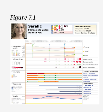
These are some of the rich health monitoring and sharing tools available on PatientsLikeMe. Note that treatments, symptoms, and quality-of-life measures can be tracked over time.