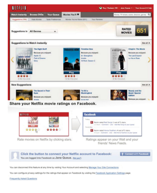
Figure 4.4 Netflix and Recommendations