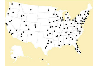
Figure 4.7 USPS Hubs Serviced by the Netflix Distribution Center Network