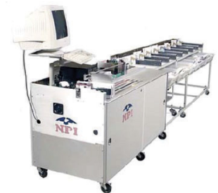
Figure 4.6 A Proprietary Netflix Sorting Machine