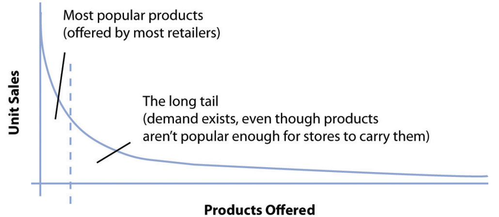
Figure 4.3 The Long Tail

The long tail works because the cost of production and distribution drop to a point where it becomes economically viable to offer a huge selection. For Netflix, the cost to stock and ship an obscure foreign film is the same as sending out the latest Will Smith blockbuster. The long tail gives the firm a selection advantage (or one based on scale) that traditional stores simply cannot match.