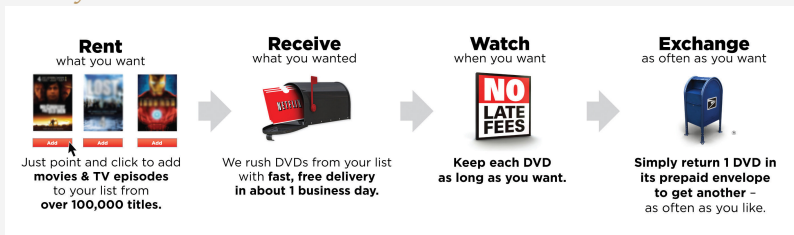
Figure 4.1 The Netflix DVD-by-Mail Model