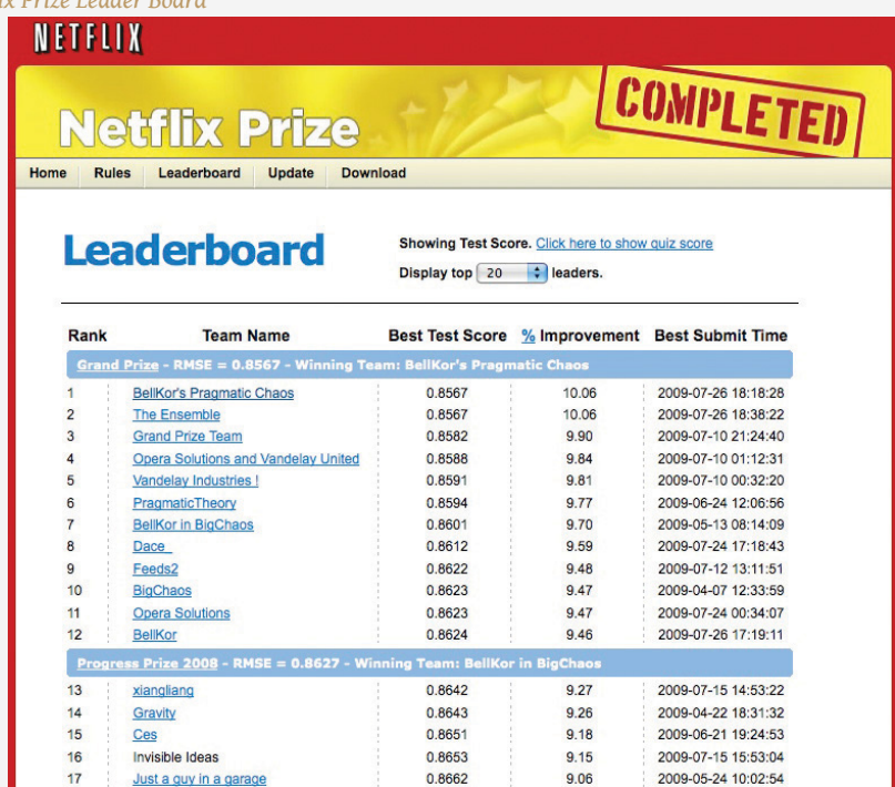
Figure 4.3 The Netflix Prize Leader Board