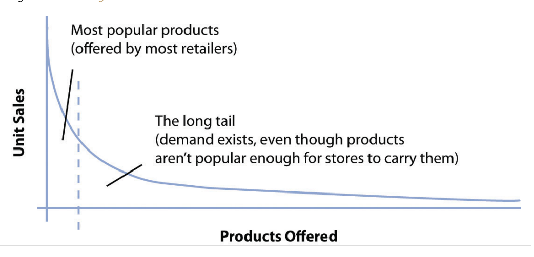
Figure 4.1 The Long Tail

The long tail works because the cost of production and distribution drop to a point where it becomes economically viable to offer a huge selection. For Netflix, the cost to stock and ship an obscure foreign film is the same as sending out the latest Will Smith blockbuster. The long tail gives the firm a selection advantage (or one based on scale) that traditional stores simply cannot match.