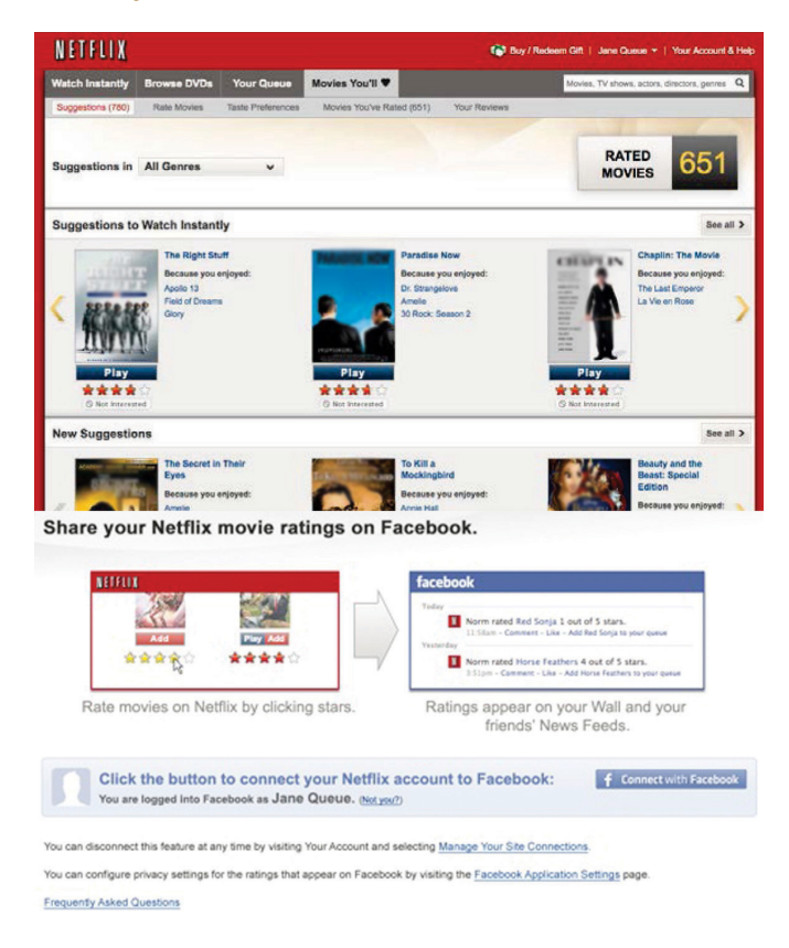
Figure 4.2 Netflix Community Features