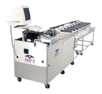
Figure 4.4 A Proprietary Netflix Sorting Machine