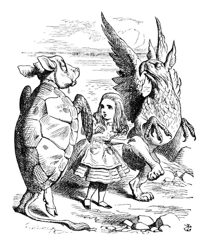
Illustration by Sir John Tenniel for Lewis Carroll's Alice's Adventures in Wonderland (1865).

You have engaged in the theory of reader response.