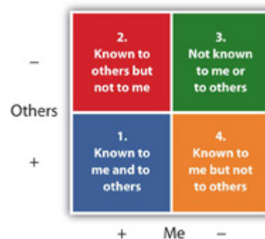
Figure 16.1 Luft and Ingram's Dimensions of Self

These dimensions of self serve to remind us that we are not fixed—that freedom to change combined with the ability to reflect, anticipate, plan, and predict allows us to improve, learn, and adapt to our surroundings. By recognizing that we are not