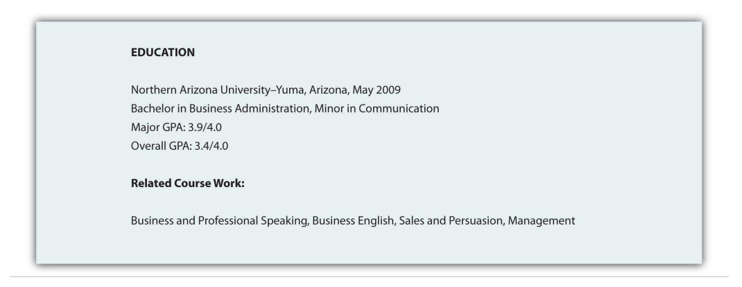
Figure 9.9 Sample Education Field

You need to list your education in reverse chronological order, with your most recent degree first. List the school, degree, and grade point average (GPA). If there is a difference between the GPA in your major courses and your overall GPA, you may want to list them separately to demonstrate your success in your chosen field. You may also want to highlight relevant coursework that directly relate to the position.