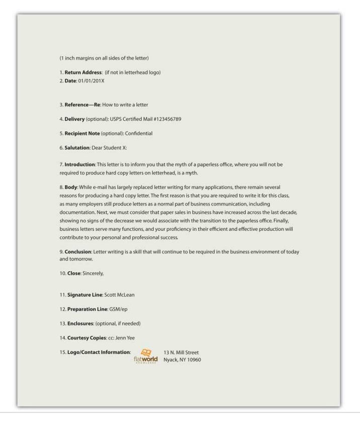
Figure 9.5 Sample Business Letter

Always remember that letters represent you and your company in your absence. In order to communicate effectively and project a positive image,