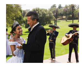
Context is all about what people expect from each other.