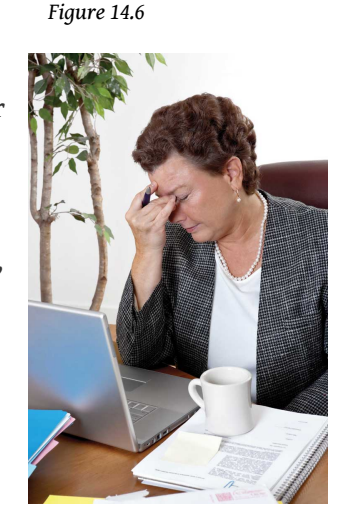
Emotions are often communicated through nonverbal gestures and actions.

Experiencing feelings and actually letting someone know you are experiencing them are two different things. We experience feeling in terms of our psychological state, or state of mind, and in terms of our physiological state, or state of our body. If we experience anxiety and apprehension before a test, we may have thoughts that correspond to our nervousness. We may also have an increase in our pulse, perspiration, and respiration (breathing) rate. Our expression of feelings by our body influences our nonverbal communication, but we can complement, repeat, replace, mask, or even contradict our verbal messages. Remember that we can't tell with any degree of accuracy what other people are feeling simply through observation, and neither can they tell what we are feeling. We need to ask clarifying questions to improve understanding. With this in mind, plan for a time to provide responses and open dialogue after the conclusion of your speech.