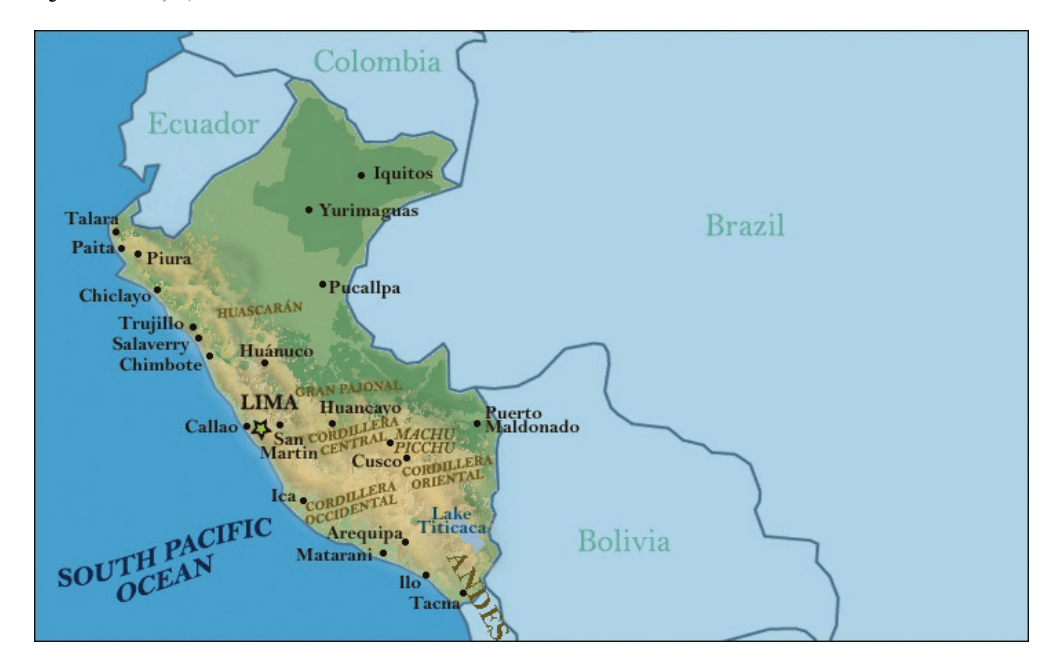
Figure 8.1 Map of Peru

Now let's continue with the example and watch native Chilean retailers enter a market new to them: Peru.