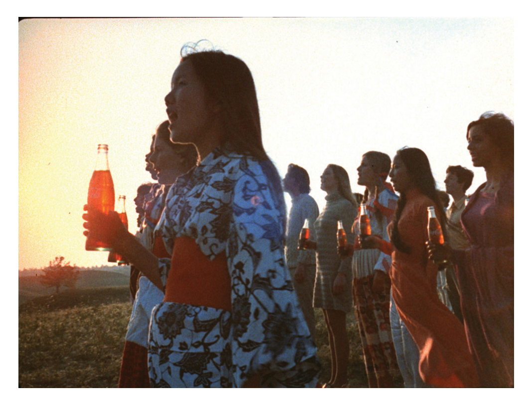
Coca-Cola has used its appeal to global consumers throughout its marketing efforts.