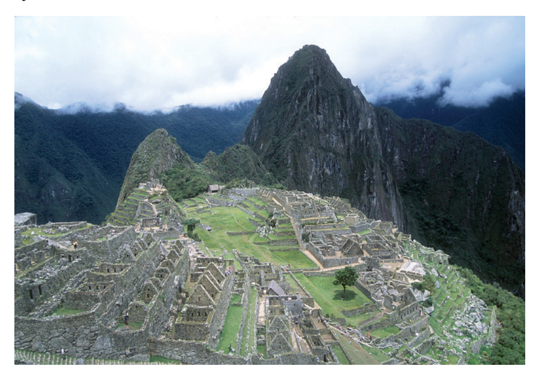
Figure 8.2 Machu Picchu

The Chilean retailers were successful in their own markets but wanted to expand beyond their borders in order to get new customers in new markets. The Chilean retailers chose to enter Peru, which had the same language.