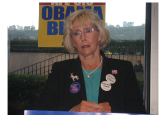
Figure 12.3 Lilly Ledbetter

A jury found Lilly Ledbetter was the victim of regular pay discrimination at Goodyear because of her gender.