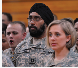
Figure 12.5 Captain Tejdeep Singh Rattan, the First Sikh Army Officer