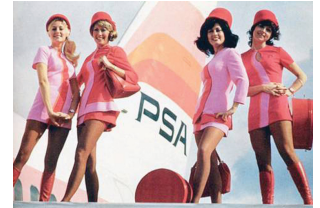
Figure 12.7 An Advertisement for PSA Airlines