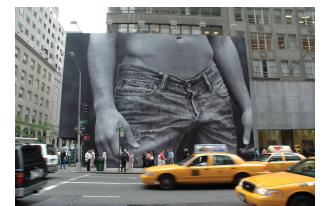
Figure 12.1 An Abercrombie & Fitch Billboard in New York City