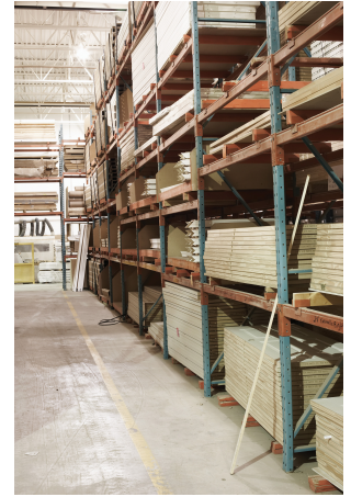
Figure 12.2 Commodities Purchased from a Supplier Using an RFQ

The project team develops an RFQ based on the quantity and schedule needs of the project and sends the RFQ to the identified qualified suppliers. The suppliers then develop a quote that lists the specific materials to be provided, the price for each, and a schedule for delivery. The project team evaluates each quote from suppliers and determines that the supplier bid meets all the requirements, and in most cases, the supplier with the lowest price will be awarded the bid.