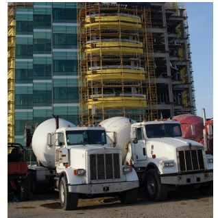
Figure 12.1 Outsourcing Supply of Construction Materials