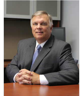
Figure 2.3 Russ Darnall—Creator of the Darnall-Preston Complexity Index

The foundation of a sound project execution plan is an assessment of the project environment. This assessment provides the information on which the execution plan is built. In the absence of an accurate assessment of the project environment, the project leadership makes assumptions and develops the execution plan around those assumptions. The quantity and quality of those assumptions will significantly influence the effectiveness of the project execution plan. The amount of information available to the project manager will increase over time and assumptions will be replaced with better information and better estimates. As better tools are developed for evaluating the project environment, better information will become available to the project manager.