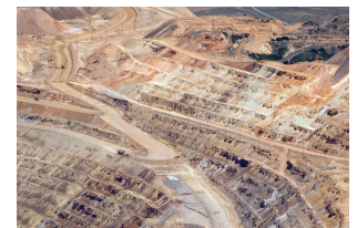
Large open pit mining project.

The more the project size is outside the comfort zone of the project, the more stress is created for the project. This is true on both ends of the spectrum. Both smaller and larger projects that fall outside the comfort zone of the project management team will create stress for the project. New skills, tools, and processes will need to be developed to manage the project, and this activity will absorb management time and energy. The higher the stress level created by executing a project outside the comfort zone of the organization, the greater the impact on the complexity level of the project.