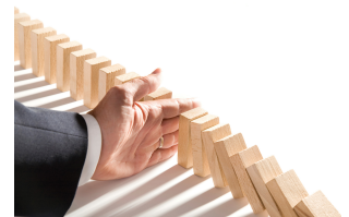
A risk mitigation plan reduces the impact of an unwanted event.