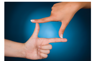
Early project decisions are based on rough estimates.