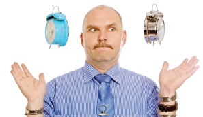
Project managers must track the schedules of several activities at the same time.