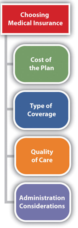
Figure 6.7 Considerations When Choosing Medical Insurance

32. A type of insurance that provides income to individuals (usually a portion of their salary) should they be injured or need long-term or short-term care resulting from an illness.