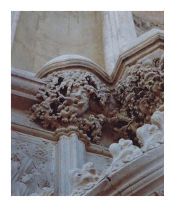
Green Man in Ely Cathedral.

The concept of medieval chivalry was famously described in 1891 by Leon Gautier, who listed ten rules of chivalry from the 11th and 12th centuries: