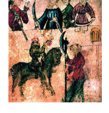
Beheading of the Green Knight.

From the manuscript Cotton Nero A.x, f. 94b