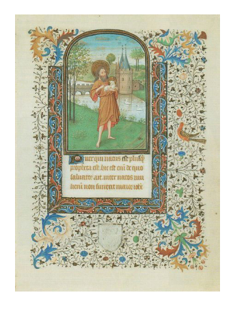
John the Baptist from a medieval book of hours.

Britain's National Trust presents <u>a video describing the Sarum Missal printed by Caxton</u>, an important extant example of the religious literature of the Middle Ages, as well as a second brief <u>video of their turn-the-pages digital copy</u> of the missal that allows a closer inspection of several pages. The British Library features a turn-the-pages digital copy of the <u>Sherborne Missal</u>.