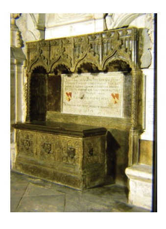
Chaucer's tomb in Westminster Abbey.