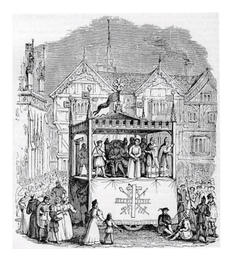
A pageant wagon in Chester, England.

Mystery plays depict events from the Bible. Often mystery plays were performed as cycle plays<sup>7</sup>, a sequence of plays portraying all the major events of the Bible, from the fall of Satan to the last judgment. Some play cycles were performed by guilds, each guild taking one event to dramatize. One of the most famous of the play cycles, the York mystery plays, is still performed in the English city of York. Records from the Chester cycle, also still performed, list which guilds were involved and which plays each guild presented. In a few places, such as York, the cycles were performed on pageant wagons that moved on a pre-determined route through the city. By staying in the same place, the audience could see each individual play as the wagon stopped and the actors performed before moving on to perform again at the next station. Four English cities were particularly noted for their cycles of mystery plays: Chester, York, Coventry, and Towneley (referred to as the Wakefield plays). Dennis G. Jerz, Associate Professor of English at Seton Hall University,