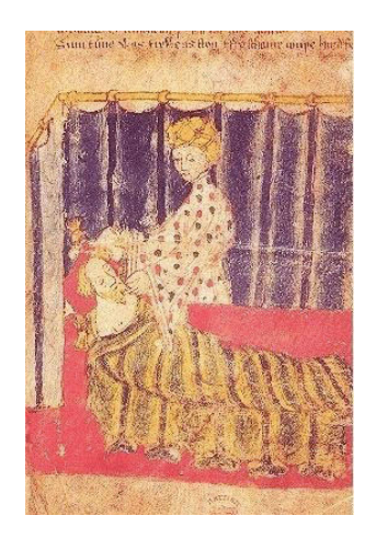
Temptation of Sir Gawain by Lady Bertilak.

<u>Images from the Middle Ages</u> portray noble couples in typical aristocratic medieval activities: playing chess, hunting with falcons, dancing, and, in some images, obviously engaging in courtly flirtations. In one scene, for example, a lady appears to be presenting a token to a knight. In another, a knight appears to have stabbed himself, possibly in despair over his unrequited love. In another scene, knights fight in a tournament while adoring ladies watch from the stands.