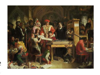
Caxton showing the first specimen of his printing to King Edward IV at the Almonry, Westminster.

The <u>British Library</u> has made available online a comparison of Caxton's two printings of Chaucer's Canterbury Tales , 1476 and 1483. In addition, Barbara Bordalejo in the Canterbury Tales Project at De Montfort University provides a <u>digitized version</u> of the British Library manuscripts that allows the reader to see the Middle English text side by side with the manuscript version and to search for specific lines and words. Britain's National Archives contains the <u>first document</u> printed by Caxton.