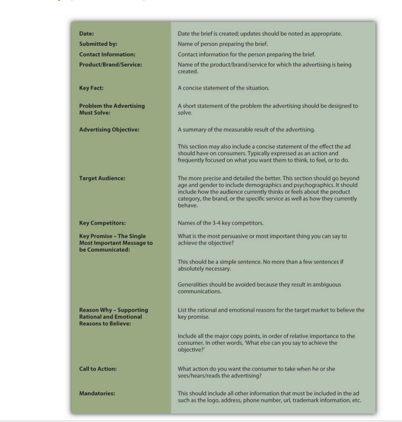
Figure 8.5 Anatomy of a Creative Brief

Proposing the Big Idea requires client agreement that the idea is right. Thus, both the advertising agency and the client must agree upon the final brief. The best briefs are written by account planners collaboratively with input from the client, account team, and creative director. One of the key functions of the SS+K brief is to come up with a single essential thought that summarizes the idea that will convince consumers to do what it is that the communication aims to do. Every agency has a proprietary brief template it uses to spell out the types of content it will need to include, such as specifying the audience, the product features, media placement ideas, and key point.