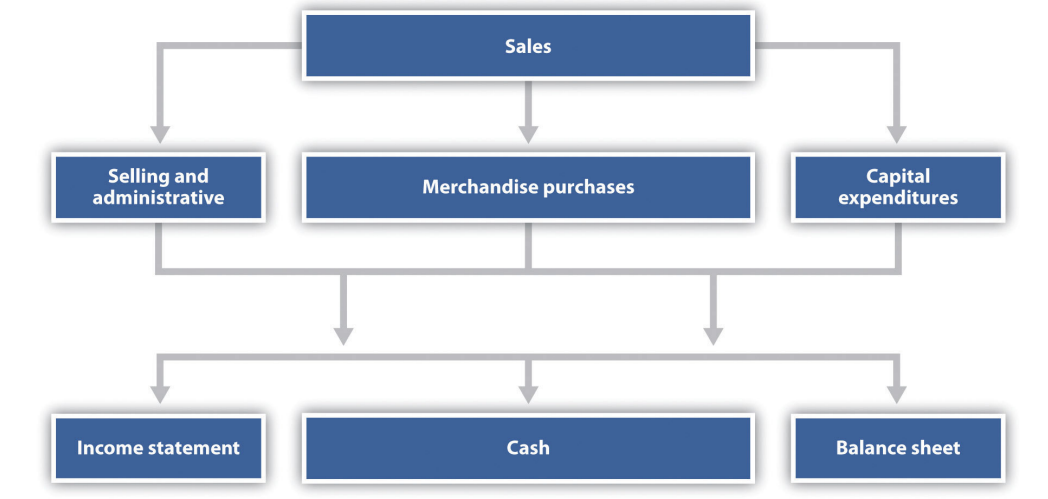
Figure 9.13 Master Budget Schedules for a Merchandising Organization

The most important aspect of budgeting for merchandising organizations is the merchandise purchases budget. The merchandise purchases budget 15 estimates the units of merchandise to be purchased and the cost per unit. Much like the production budget for a manufacturing company, the merchandise purchases budget estimates units to be purchased (instead of units to be produced) and is based on sales projections, as well as an estimate of desired ending merchandise inventory less beginning merchandise inventory.