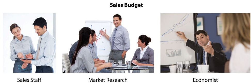
Figure 9.2 Estimating Sales

salespeople have daily contact with customers and direct information about customer demand. Some companies pay for market trend data to learn about industry and product trends. Many organizations hire market research consultants to obtain and review industry data and ultimately to predict customer demand. Larger companies sometimes employ economists to develop sophisticated models used to project sales. Smaller, less sophisticated organizations simply base their estimates on past trends. Figure 9.2 "Estimating Sales" shows how companies obtain sales information from sales people, market research consultants, and economists.