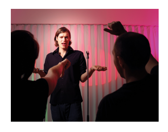
Comedians make a living by making language fun, but humor is contextual and not always easy to pull off.

As we already learned, language is essentially limitless. We may create a one-of-a-kind sentence combining words in new ways and never know it. Aside from the endless structural possibilities, words change meaning, and new words are created daily. In this section, we'll learn more about the dynamic nature of language by focusing on neologisms and slang.