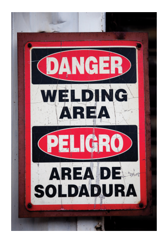
People who work or live in multilingual settings may engage in code-switching several times a day.

Additionally, people who work or live in multilingual settings may code-switch many times throughout the day, or even within a single conversation. Increasing outsourcing and globalization have produced heightened pressures for code-switching. Call center workers in India have faced strong negative reactions from British and American customers who insist on "speaking to someone who speaks English." Although many Indians learn English in schools as a result of British colonization, their accents prove to be offputting to people who want to get their cable package changed or book an airline ticket. Now some Indian call center workers are going through intense training to be able to code-switch and accommodate the speaking style of their customers. What is being called the "Anglo-Americanization of India" entails "accentneutralization," lessons on American culture (using things like Sex and the City DVDs), and the use of Anglo-American-sounding names like Sean and Peggy. Amitabh Pal, "Indian by Day, American by Night," The Progressive, August 2004, accessed June 7, 2012,