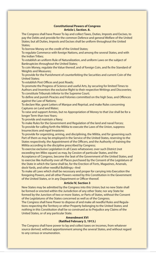
Figure 12.1 Constitutional Powers of Congress

Certain powers are granted specifically to the House, such as the power to initiate all tax and spending bills. While the Senate cannot propose such bills, it can accept, reject, or amend them. The Senate has certain authority not vested in the House. High-level presidential nominees, such as cabinet officers, Supreme Court justices, and ambassadors, must gain Senate approval. The Senate also must concur in treaties with foreign countries.