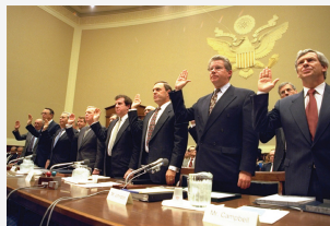
The chairmen of the seven leading tobacco companies swear that nicotine is not addictive.

On April 14, 1994, the chief executives of the leading tobacco companies stood up, raised their right hands, and swore before members of the subcommittee on Health and the Environment of the House of Representatives' Committee on Energy and Commerce that nicotine was not addictive. The photograph of this moment, prominently featured in the US and foreign media, has become an enduring image of business executives who place the interests and profits of their corporations above the public interest even if it requires them to engage in self-deception, defy common sense about the dangers of their products, and give deceptive testimony under oath.