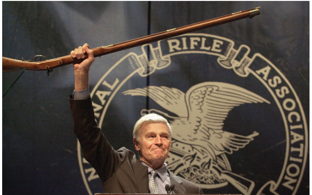
Figure 9.2 Charlton Heston

As its president, this hero of some of Hollywood's greatest epics brought the NRA even more prominence, especially when he uttered his defiant phrase.