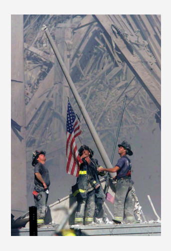
The iconic photograph of 9/11 firefighters raising a flag near the rubble of the World Trade Center plaza is immortalized in a US postage stamp. Thomas Franklin, the veteran reporter who took the photo, said that the image reminded him of the famous Associated Press image of Marines raising the American flag on Iwo Jima during World War II.

Some people suggested a compromise—two statues. They proposed that the statue based on the Franklin photo should reflect historical reality; a second statue, celebrating multiculturalism, should be erected in front of another FDNY station and include depictions of rescue workers of diverse backgrounds at the World Trade Center site. Plans for any type of statue were abandoned as a result of the controversy.