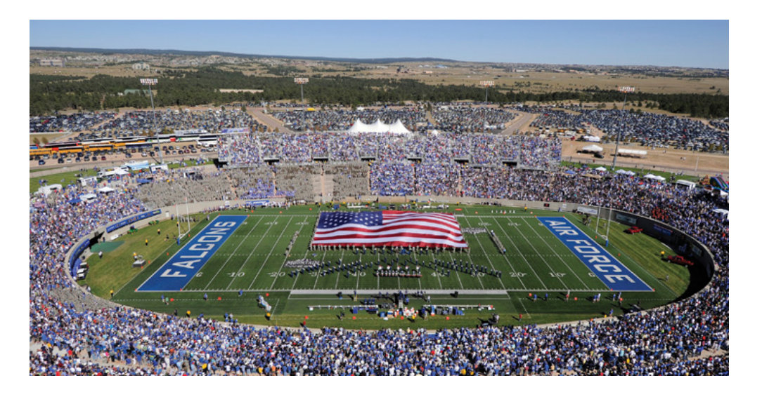
Prior to a football game in September 2010, cadets from the US Air Force Academy unfurl a large American flag in Falcon Stadium to commemorate the people who lost their lives in the 9/11 terrorist attacks.

Immediately following the 9/11 terrorist attacks, there was a huge increase in the sale and display of the American flag. Nowhere was the trend more apparent than on television news broadcasts: news anchors wore American-flag lapel pins, and background visuals featured themes such as "America Fights Back," wrapped in the flag's color scheme of red, white, and blue.