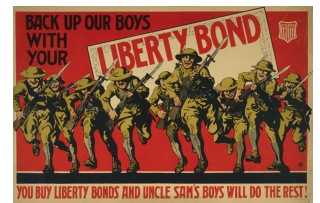
Edward Bernays created campaigns using the persuasive communication model.