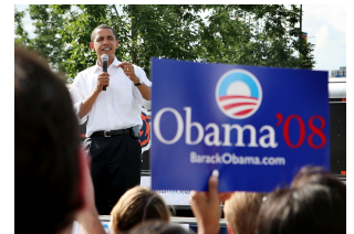
The 2008 Obama campaign used logos as a way to publicize Obama's brand.