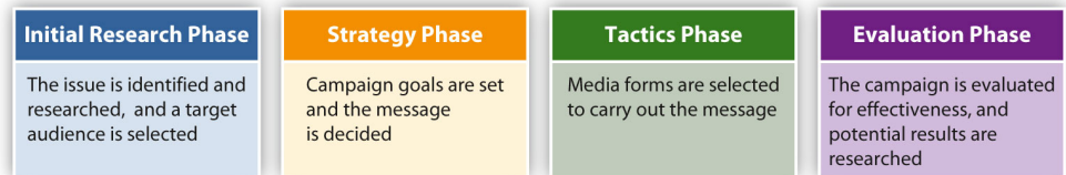
Anatomy of a PR campaign

PR campaigns occur for any number of reasons. They can be a quick response to a crisis or emerging issue, or they can stem from a long-term strategy tied in with other marketing efforts. Regardless of its purpose, a typical campaign often involves four phases.