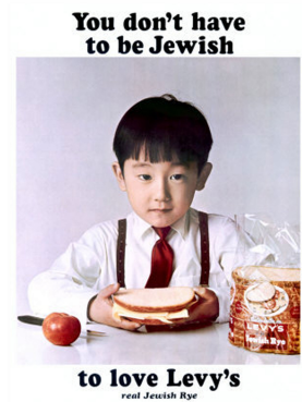
Unusual for the time, Levy's rye bread ads made diversity a selling point.