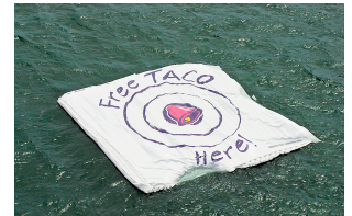
Taco Bell floated a target in the Pacific Ocean as part of a PR campaign.

Tobacco company Philip Morris started underwriting cultural institutions and causes as diverse as the Joffrey Ballet, the Smithsonian, environmental awareness, and health concerns. Marlboro sponsored events that brought a great deal of media attention to the brand. For example, during the 1980s, the Marlboro Country Music Tour took famous country stars to major coliseums throughout the country and featured talent contests that brought local bands up on stage, increasing the audience even further. Favorable reviews of the shows generated positive press for Marlboro. Later interviews with country artists and books on country music history have also mentioned this tour.