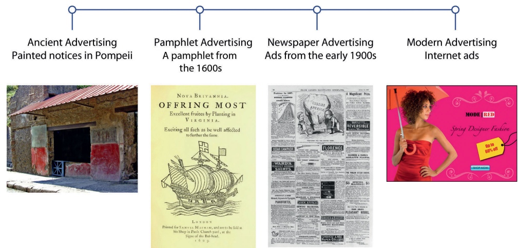
History of Advertising