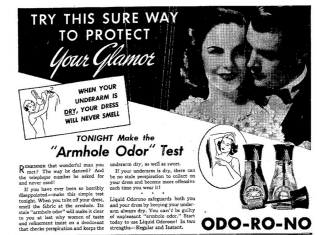
Advertisements for deodorants and other hygiene products broke social taboos about public discussion of hygiene.

Up through the 1960s, most advertising agencies were owned and staffed by affluent white men, and advertising’s portrayals of typical American families reflected this status quo. Mainstream culture as propagated by magazine, radio, and newspaper advertising was that of middle- or upper-class white suburban families. Roland Marchand, Advertising the American Dream: Making Way for Modernity, 1920–1940 (Berkeley: University of California Press, 1985), 77–79. This sanitized image of the suburban family, popularized in such TV programs as Leave It to Beaver , has been mercilessly satirized since the cultural backlash of the 1960s.