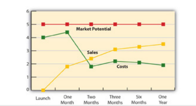
Figure 16.8 A Marketing Plan Timeline Illustrating Market Potential, Sales, and Costs