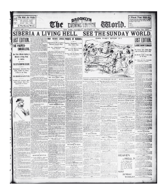
The penny press appealed to readers' desires for lurid tales of murder and scandal.

the American lifestyle—a lifestyle that was increasingly driven and defined by consumer purchases. "Americans in the 1920s were the first to wear ready-made, exact-size clothing...to play electric phonographs, to use electric vacuum cleaners, to listen to commercial radio broadcasts, and to drink fresh orange juice year round."Steven Mintz, "The Jazz Age: The American 1920s: The Formation of Modern American Mass Culture," Digital History , 2007, <a href="http://www.digitalhistory.uh.edu/database/article_display.cfm?hhid=454">http://www.digitalhistory.uh.edu/database/article_display.cfm?hhid=454</a>. This boom in consumerism put its stamp on the 1920s and also helped contribute to the Great Depression of the 1930s.Library of Congress, "Radio: A Consumer Product and a Producer of Consumption," Coolidge-Consumerism Collection, <a href="http://lcweb2.loc.gov:8081/ammem/amrlhtml/inradio.html">http://lcweb2.loc.gov:8081/ammem/amrlhtml/inradio.html</a>. The consumerist impulse drove production to unprecedented levels, but when the Depression began and consumer demand dropped dramatically, the surplus of production helped further deepen the economic crisis, as more goods were being produced than could be sold.