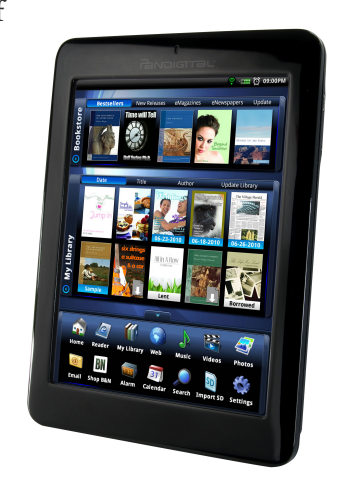
E-readers offer authors a way to get around the traditional publishing industry, but their thousands of options can make choosing hard on readers.