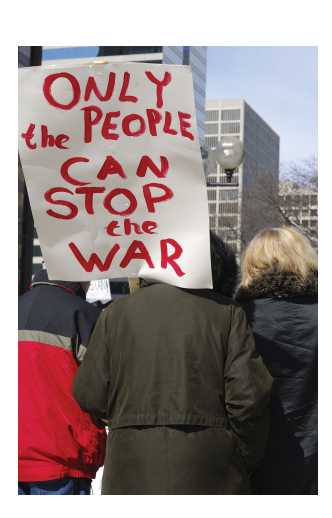
An important source of change in social problems is protest by a social change group or movement.

That is why this book stresses the second part of the subtitle, change. Although social problems are indeed persistent, it is also true that certain problems are less serious now than in the past. Change is possible. As just one of many examples, consider the conditions that workers face in the United States. As Chapter 12 "Work and the Economy" discusses, many workers today are unemployed, have low wages, or work in substandard and even dangerous workplaces. Yet they are immeasurably better off than a century ago, thanks to the US labor movement that began during the 1870s. Workers now have the eight-hour day, the minimum wage (even if many people think it is too low), the right to strike, and workplaces that are much safer than when the labor movement began. In two more examples, people of color and women have made incredible advances since the 1960s, even if, as Chapter 3 "Racial and Ethnic Inequality" and Chapter 4 "Gender