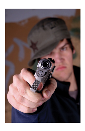
To explain armed robbery, symbolic interactionists focus on how armed robbers decide when and where to rob a victim and on how their interactions with other criminals reinforce their own criminal tendencies.

For its part, symbolic interactionism would focus on how armed robbers make such decisions as when and where to rob someone and on how their interactions with other criminals reinforce their own criminal tendencies. It would also investigate how victims of armed robbery behave when confronted by a robber. To reduce