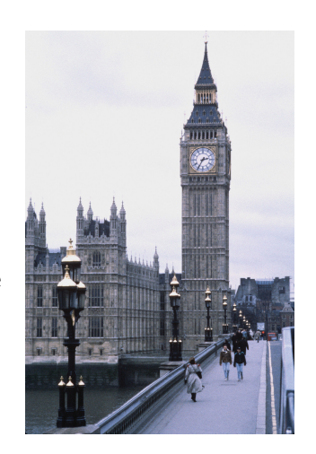
Many other democracies rank higher than the United States on poverty, health, and other social indicators. For this reason, the United States may have much to learn from their positive examples.

Change also occurs in social problems because policymakers (elected or appointed officials and other individuals) pass laws or enact policies that successfully address a social problem. They often do so only because of the pressure of a social movement, but sometimes they have the vision to act without such pressure. It is also true that many officials fail to take action despite the pressure of a social movement, so those who do take action should be applauded. A recent example involves the governor of New York, Andrew Cuomo, who made the legalization of same-sex marriage a top priority for his state when he took office in January 2011. After the New York state legislature narrowly approved same-sex marriage six months later, Cuomo's advocacy was widely credited for enabling this to happen (Barbaro, 2011).Barbaro, M. (2011, June 6). Behind NY gay marriage, an unlikely mix of forces. New York Times, p. A1.