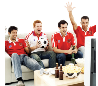
Cohesion and shared identity help create symbolic convergence as group members develop a group identity and shared social reality.