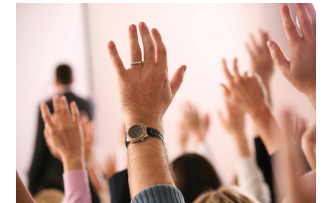
Procedural conflict can often be resolved with a group vote.