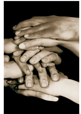
Group membership helps meet our interpersonal needs by

The prestige of a group can initially attract us because we want that group’s identity to “rub off” on our own identity. Likewise, the achievements we make as a group member can enhance our self-esteem, add to our reputation, and allow us to create or project certain identity characteristics to engage in impression management. For example, a person may take numerous tests to become a part of Mensa, which is an organization for people with high IQs, for no material gain but for the recognition or sense of achievement that the affiliation may bring. Likewise, people may join sports teams, professional organizations, and honor societies for the sense of achievement and affiliation. Such groups allow us opportunities to better ourselves by encouraging further development of skills or knowledge. For example, a person who used to play the