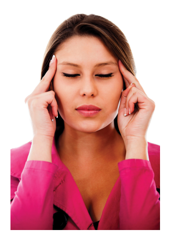
Mindreading leads to patterned conflict, because we wrongly presume to know what another person is thinking.

Validating the person with whom you are in conflict can be an effective way to deescalate conflict. While avoiding or retreating may seem like the best option in the moment, one of the key negative traits found in research on married couples' conflicts was withdrawal, which as we learned before may result in a demandwithdrawal pattern of conflict. Often validation can be as simple as demonstrating good listening skills discussed earlier in this book by making eye contact and giving verbal and nonverbal back-channel cues like saying "mmm-hmm" or nodding your head. John M. Gottman, What Predicts Divorce?: The Relationship between Marital Processes and Marital Outcomes (Hillsdale, NI: Lawrence Erlbaum Associates, 1994). This doesn't mean that you have to give up your own side in a conflict or that you agree with what the other person is saying; rather, you are hearing the other person out, which validates them and may also give you some more information about the conflict that could minimize the likelihood of a reaction rather than a response.